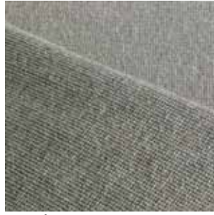
mov.e 2 - 3777 cashew