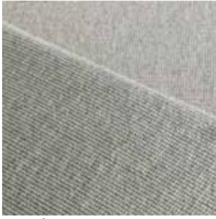
mov.e 2 - 3778 cornsilk