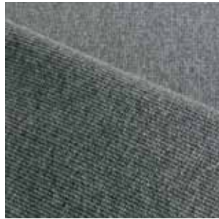
mov.e 2 - 3796 granite