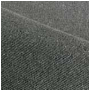
mov.e 2 - 3779 mushroom